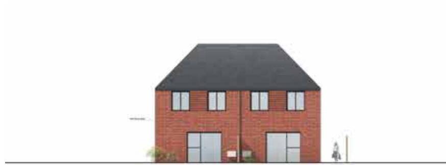
East elevation (Rear)