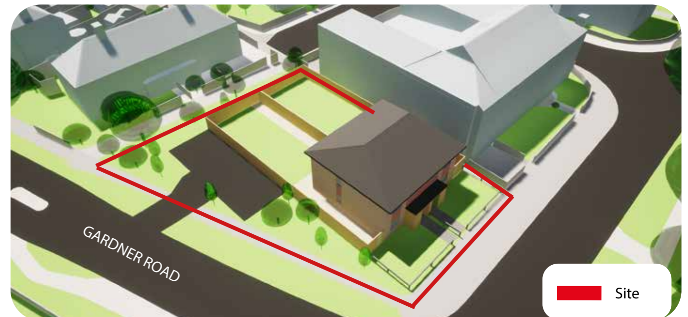
3D view from North