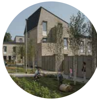
Examples of landscapes