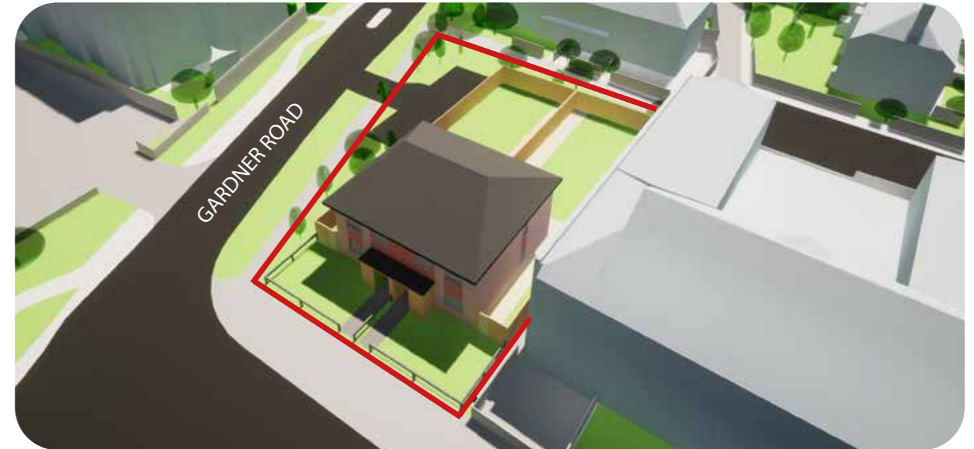
3D view from West