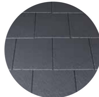
Grey roof tiles