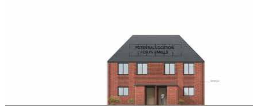
West elevation (Front)